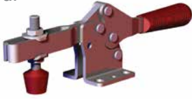
237-U Flanged Base U-Bar