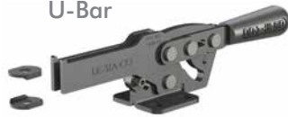
2017-U-LS-BLK ⓘ Blackout Series Flanged Base U-Bar